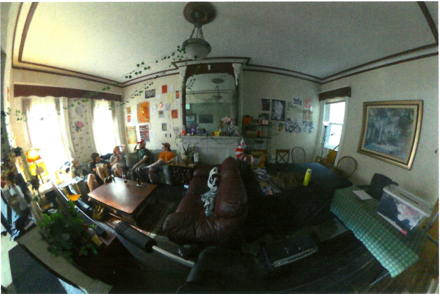
The living room

QUALIFICATIONS: audio engineering degree from Temple University