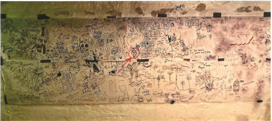
The art wall

MEMORABLE NOVELTY: The guitarist from Kikagaku Moyo played a show that incorporated kabuki theater - a performer in kumadori makeup walked through the crowd around the basement during the set.