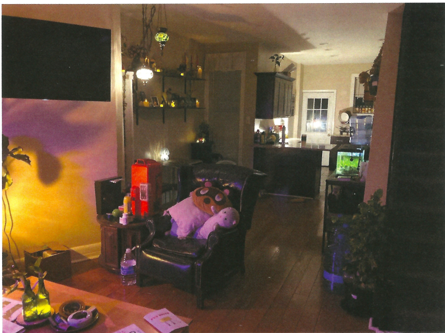
The living room

GENRES: all (started with psych) ACCESSIBLE VIA: Route 68; Broad Street Line BOOKING: Instagram DMs; mostly take on full bills, first come first served, 2-3 shows per month