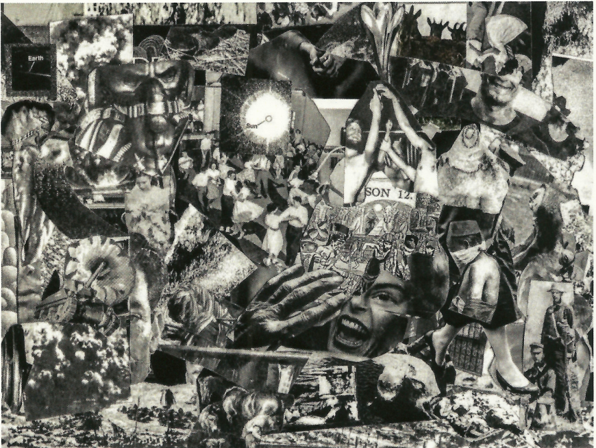
art by salt @ salt.malt

GNOMIC TRUTHS: "Live music is important; it's a spiritual communion. Running DIY shows is too much work to do ironically. Make a cool space, invite your friends, and never stop hanging out."